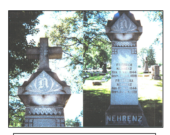
Tombstone of Frederick and Frederika Nehrenz - Lutheran Cemetery Cleveland, OH