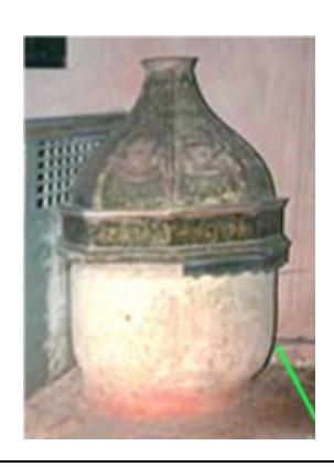
Baptism font - Lutheran church in Trollenhagen Germany where Frederick and Frederika were baptized