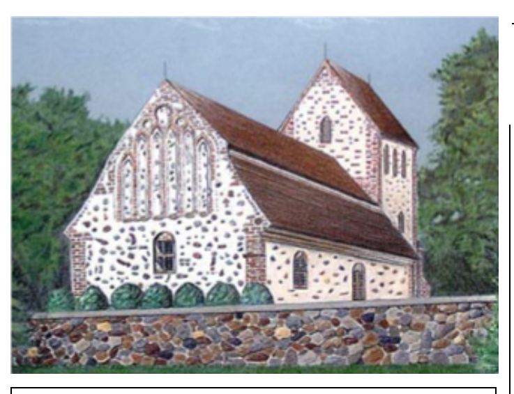
Trollenhagen church in Germany, the ancestral church of the Nehrenzs. Painted by Ruby Wolcott