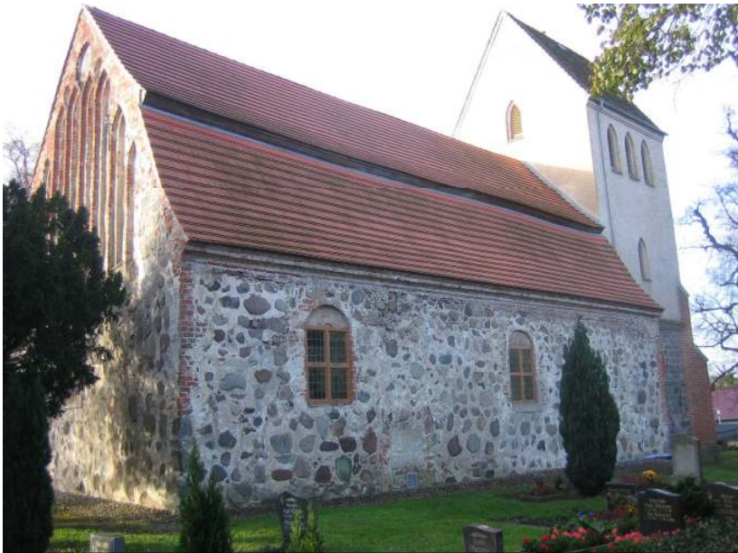
Lutheran Church in Trollenhagen, Germany